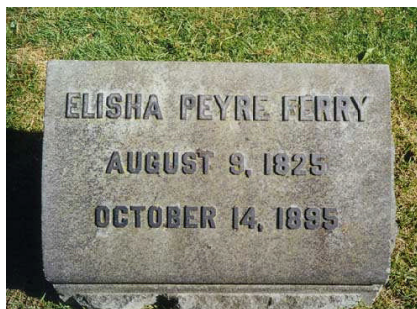
Figure 2. Elisha P Ferry grave marker next to tombstone in Lake View Cemetery in Seattle.

Brother Elisha P. Ferry was born in Monroe, Michigan, August 9, 1825, and received his education in his native state. Studied law in Indiana and was admitted to the bar in 1845, being but twenty years of age. Moving to the state of Illinois he began the practice of his profession, was active in politics and a member of the first Republican National Convention. He rendered distinguished service on the staff of Governor Yates, of Illinois, with the rank of Colonel during the war of the rebellion. In 1869 he was appointed Surveyor General of the Territory of Washington and moved to Olympia to take charge of the duties of his office. He was one of the charter members of Harmony Lodge and was the first Senior Deacon. Was elected Senior Warden in 1872, Worshipful Master in 1873, 1874, 1875, and Junior Warden in 1876, Senior Warden in 1877. Brother Ferry was elected Grand Master of the Most Worshipful Grand Lodge of the Territory of Washington in 1878 and also re-elected as Worshipful Master of Harmony Lodge, No. 18, for the same year. In 1872 he was appointed Governor of the Territory of Washington and reappointed in 1876. In 1880 he moved to Seattle and engaged in the practice of law, and later in the banking business, being vice-president of the Puget Sound National Bank. On September 4, 1889, he was nominated for Governor of the newly created State of Washington. Removing again to Olympia to assume his new duties, Harmony Lodge, on December 11, 1889, re-elected him as Worshipful